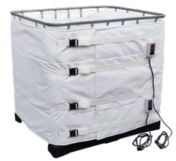
2 Zone 0-90°C 2x1000W 230V: 20-2797