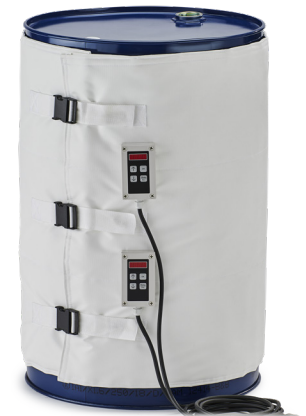
1 zone - 230V 1200W: 19-2746 2 zones - 230V 2x600W: 12-1208DT