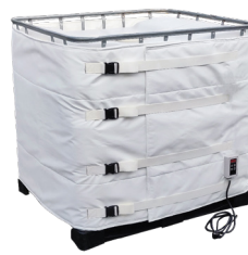
1 Zone 0-40°C 1300W 230V: 20-2798