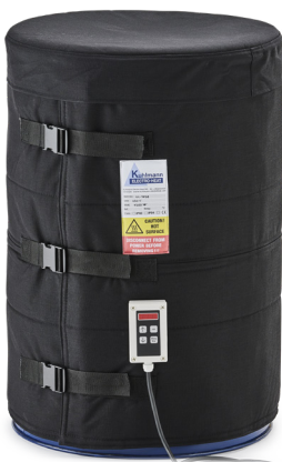
110V 1200W: 11-9858A 230V 1200W: 11-9858