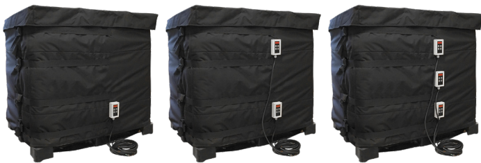
1 Zone (0-40°C) 1300W 230V: 11-9860A