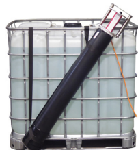
Cleaning Tube for Internal IBC Heater 20-2904c