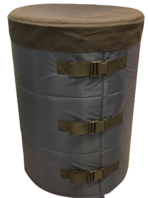
Jacket: 17-2330 Lid: 15-1921