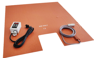
IBC Base Heater (0-150°C) 2700W 230V: 13-1436S