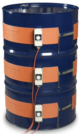
230V 1000W: 11-9867