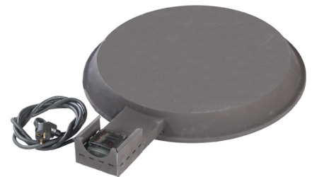
110V 1800W: 12-1170A 230V 1800W: 12-1170