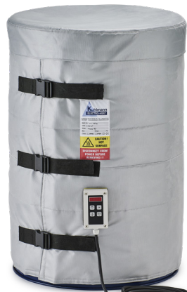
110V 1200W: 11-9870A 230V 1200W: 11-9870