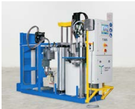
Design example of a TARDOSIL with 200 l tank (A) and 30 l pressure tank (B) with automatic refill