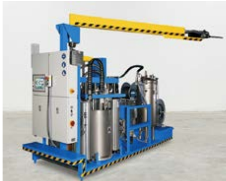
Design example of a volume flow controlled TARDOSIL with automatic refilling for A and B