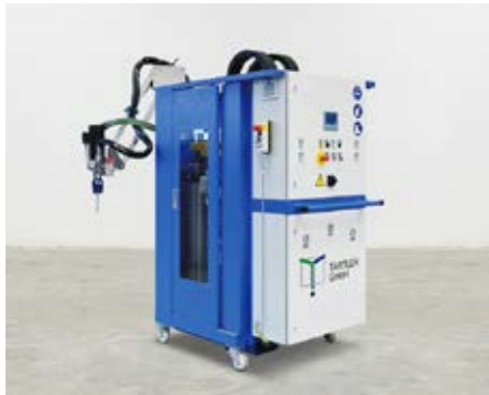
Design example of a NODOPOX with vacuum-supported drum change for 50 l drums