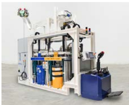
Design example of a NODOPOX for 200 l drums with automated refilling and its own drive unit