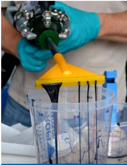
The flat nozzle is plugged onto the tip of the mixer sleeve without an adapter or any cumbersome clamping device