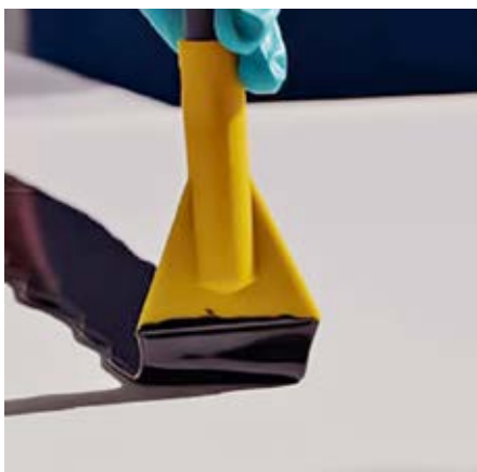
The flat nozzle supports not only the smooth application of synthetic resins, but also the thin-layer and material-saving surface coating

The flat nozzles are available in widths of 40 mm, 60 mm and 80 mm or with a variable outlet of up to 120 mm for an even, thin application of liquid synthetic resins. The nozzle is plugged onto the mixer sleeve with an outer diameter of 17 mm (standard type 13 /12er), or linked by a hose connection.