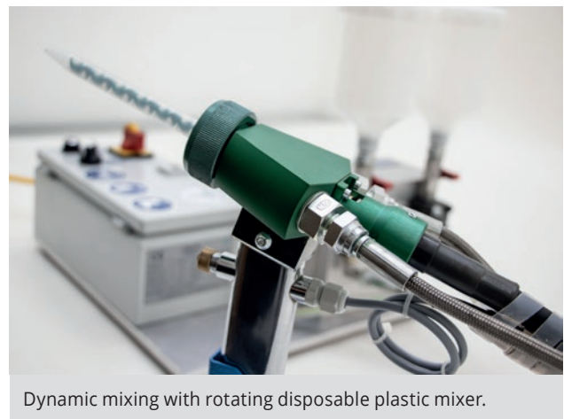
Dynamic mixing with rotating disposable plastic mixer.